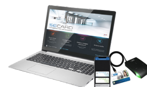
SECARD SECard configuration kit and SSCP® v1 & v2 and OSDP™ protocols

*Our readers only read the iCLASS™ chip serial number / UID PICO1444-3B. They do not read iCLASS™ cryptographic protection or the HID Global serial number / UID PICO1444-3B.